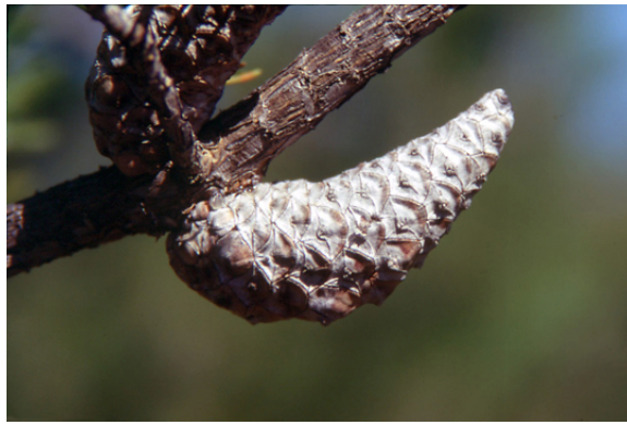
Figure 44.11 The mature cones of the jack pine ( Pinus banksiana ) open only when exposed to high temperatures, such as during a forest fire. A fire is likely to kill most vegetation, so a seedling that germinates after a fire is more likely to receive ample sunlight than one that germinates under normal conditions. (credit: USDA)