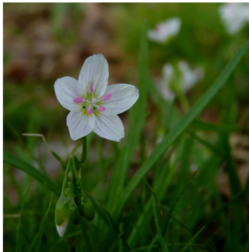
Figure 44.8 The spring beauty is an ephemeral spring plant that flowers early in the spring to avoid competing with larger forest trees for sunlight. (credit: John Beetham)

Energy from the sun is captured by green plants, algae, cyanobacteria, and photosynthetic protists. These organisms convert solar energy into the chemical energy needed by all living things. Light availability can be an important force directly affecting the evolution of adaptations in photosynthesizers. For instance, plants in the understory of a temperate forest are shaded when the trees above them in the canopy completely leaf out in the late spring. Not surprisingly, understory plants have adaptations to successfully capture available light that passes through the canopy. One such adaptation is the rapid growth of spring ephemeral plants such as the spring beauty ( Claytonia virginica ) ( Figure 44.8 ). These spring flowers achieve much of their growth and finish their life cycle (reproduce) early in the season before the trees in the canopy develop leaves.