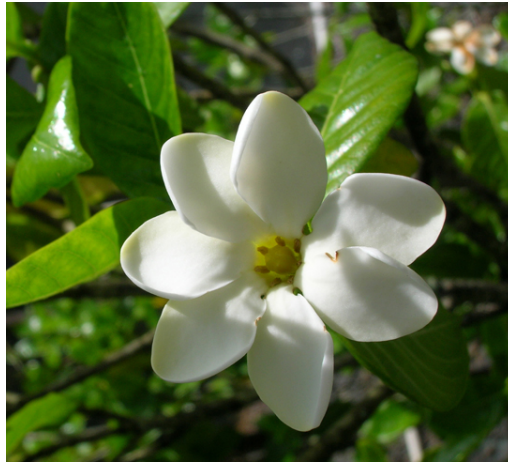
Figure 44.7 Listed as federally endangered, the forest gardenia is a small tree with distinctive flowers. It is found only in five of the Hawaiian Islands in small populations consisting of a few individual specimens.