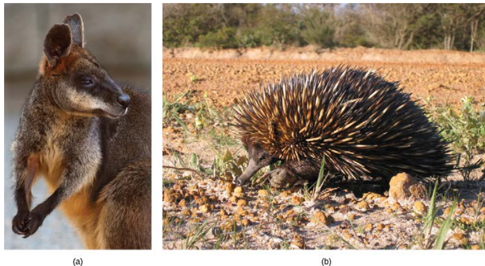
Figure 44.6 Australia is home to many endemic species. The (a) wallaby ( Wallabia bicolor ), a medium-sized member of the kangaroo family, is a pouched mammal, or marsupial. The (b) echidna ( Tachyglossus aculeatus ) is an egg-laying mammal. (credit a: modification of work by Derrick Coetzee; credit b: modification of work by Allan Whittome)

Sometimes ecologists discover unique patterns of species distribution by determining where species are not found. Despite being tropical, Hawaii, for example, has no native land species of reptiles or amphibians, only a few native species of butterflies, and only one native terrestrial mammal, the hoary bat. Most of New Guinea, as another example, lacks placental mammals.